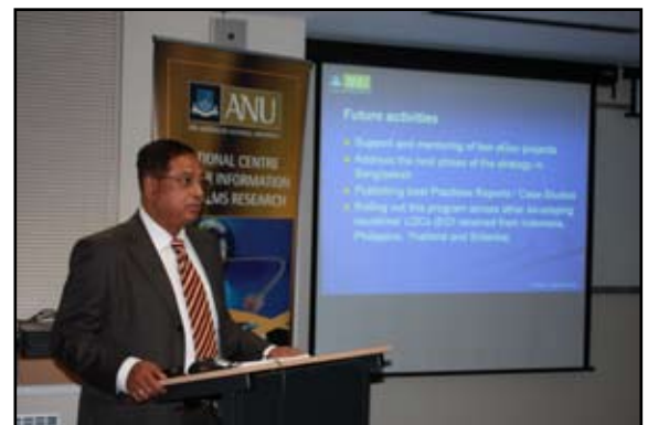
High Commissioner of Bangladesh Lt Gen Masud Usddin Chowdhury

I believe this effort will be a great help not only to Bangladesh but to many other least developed countries around the globe... I would like to congratulate the team for the completion of the task.